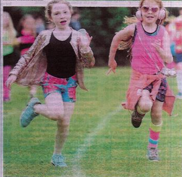
Participants in the Ripley Court School sponsored walk raising funds for Cherry Trees and Jigsaw School