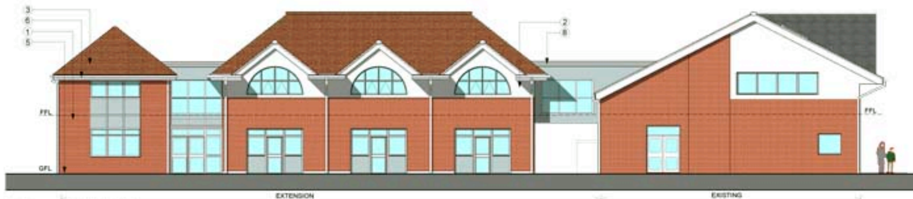
1 Proposed South Elevation 1:100