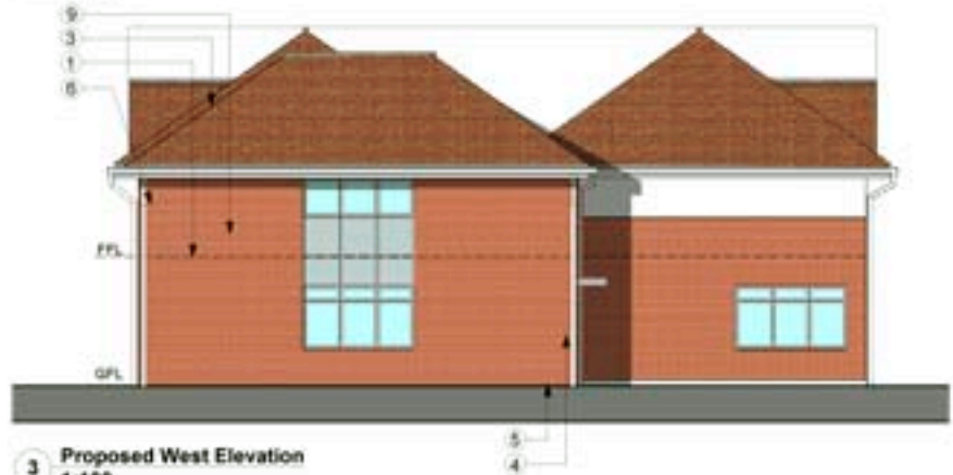
3 Proposed West Elevation 1:100