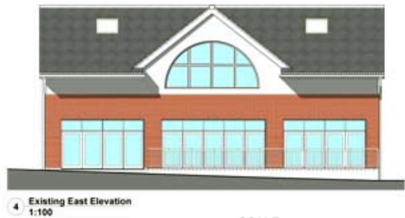
4 Existing East Elevation 1:100